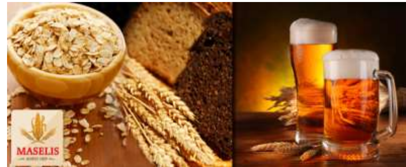
Specialised in producing breakfast cereals, cereal-based ingredients and maize flour