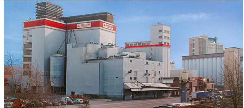
Factory Maselis Roeselare